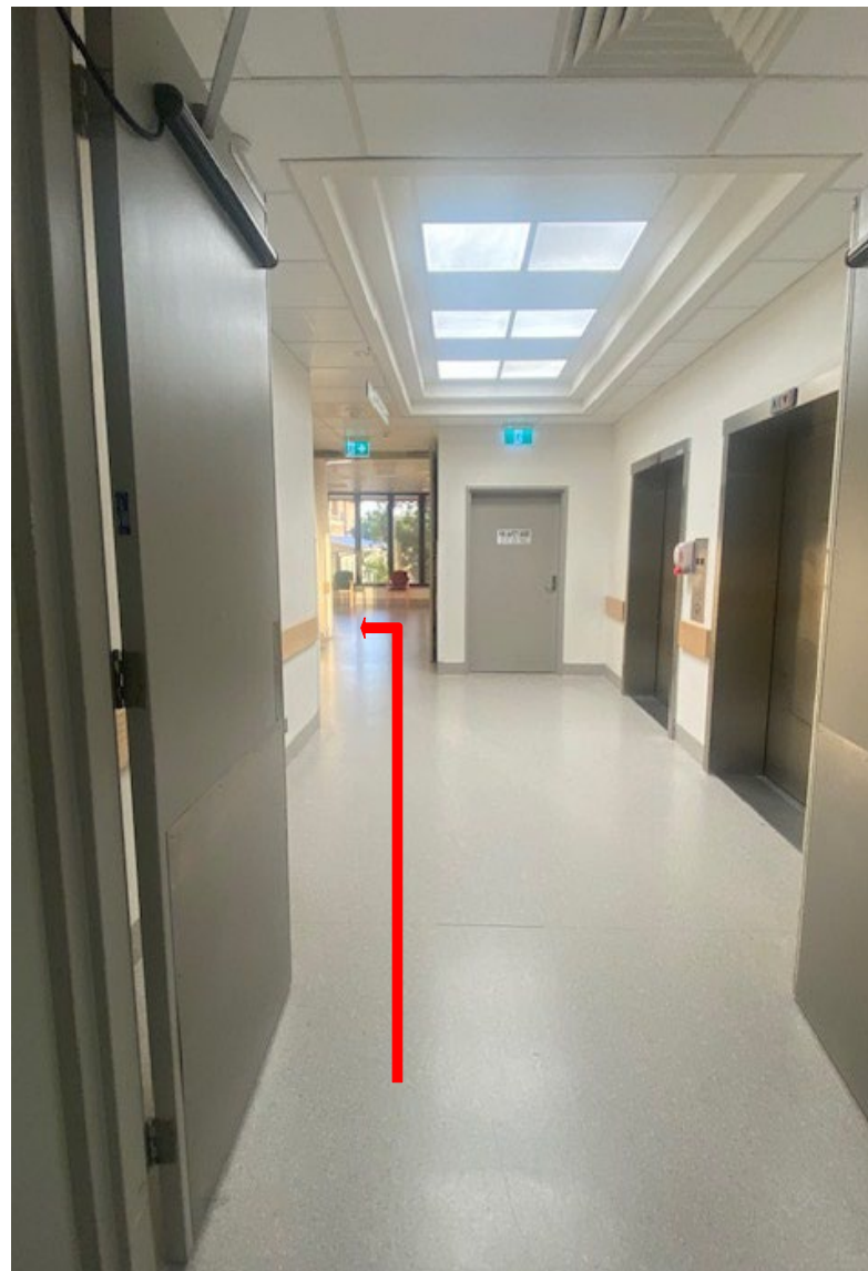
Turn left - go down the corridor GO pass Day Surgery