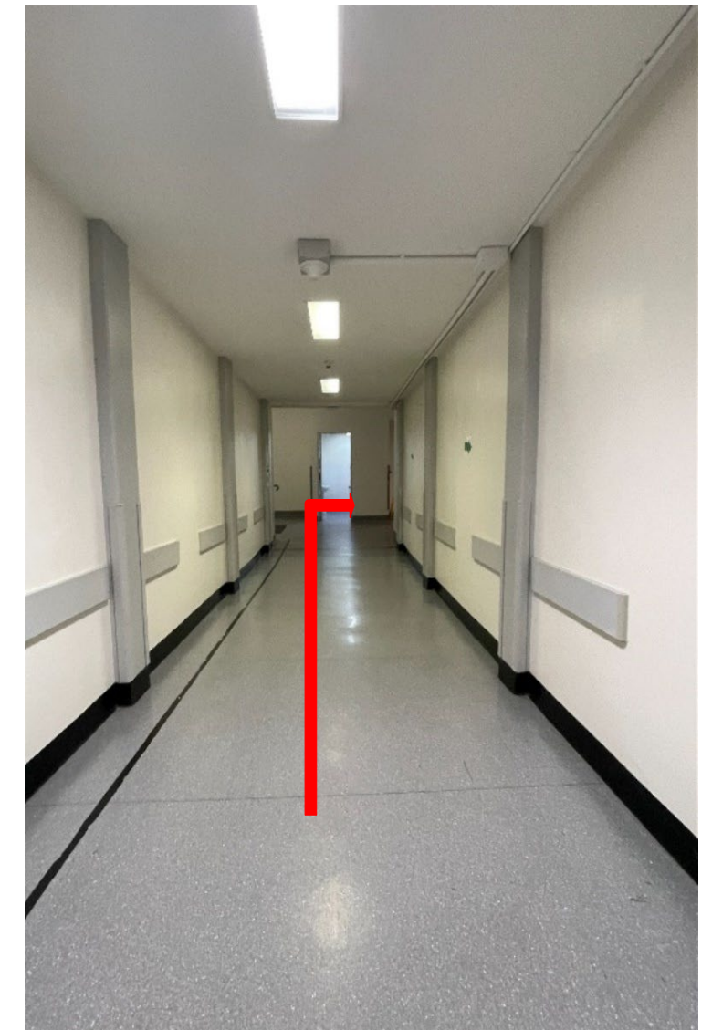
Continue down the ramp. Turn left!

St George Integrated Community Health is on the right.