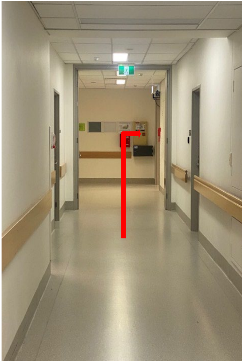
Turn right – go through the doors pass the lift.