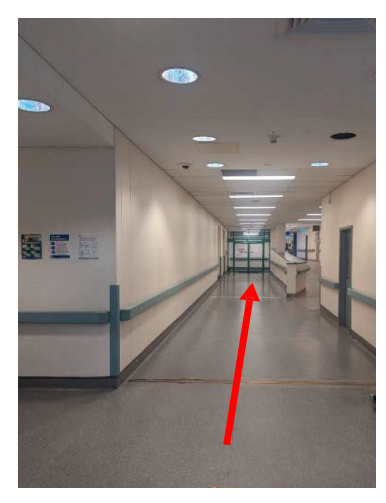
Walk straight up towards the lifts