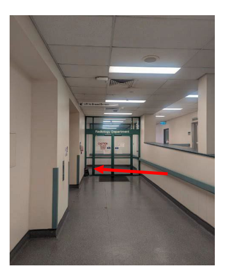
Take lift 1<sup>st</sup> floor.