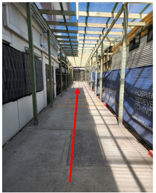
Walk up the path towards the gate.